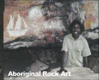
Aboriginal Rock Art